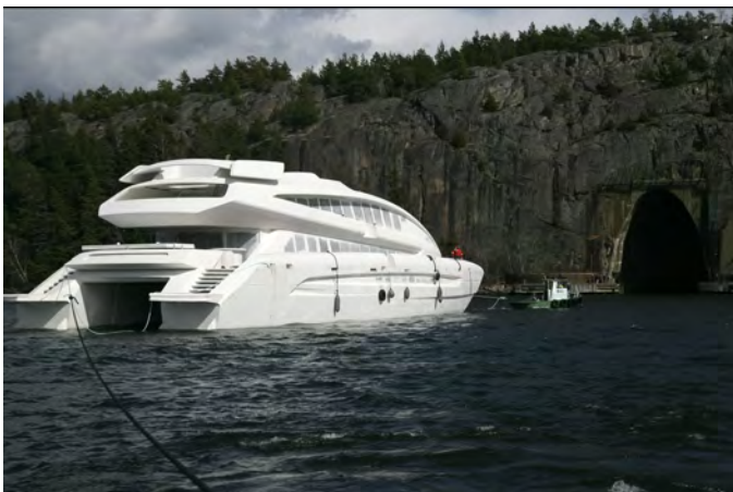
RFF 135 at the Kockums Shipyard in Sweden

For more details: www.royalfalconfleet.com